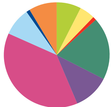
Level 2: Professional Training